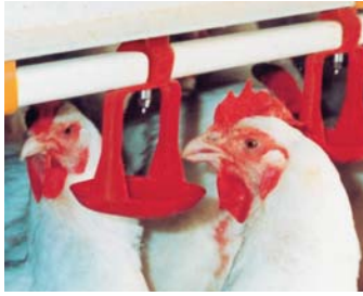
Breeder Nipple with LitterGuard™