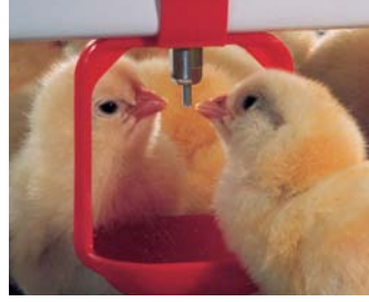
FeatherSoft™ Nipple with or without LitterGuard™